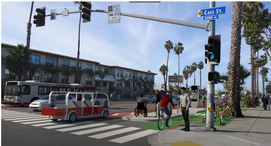
SANDAG's visual simulation of Balboa Avenue mobility hub amenities and services