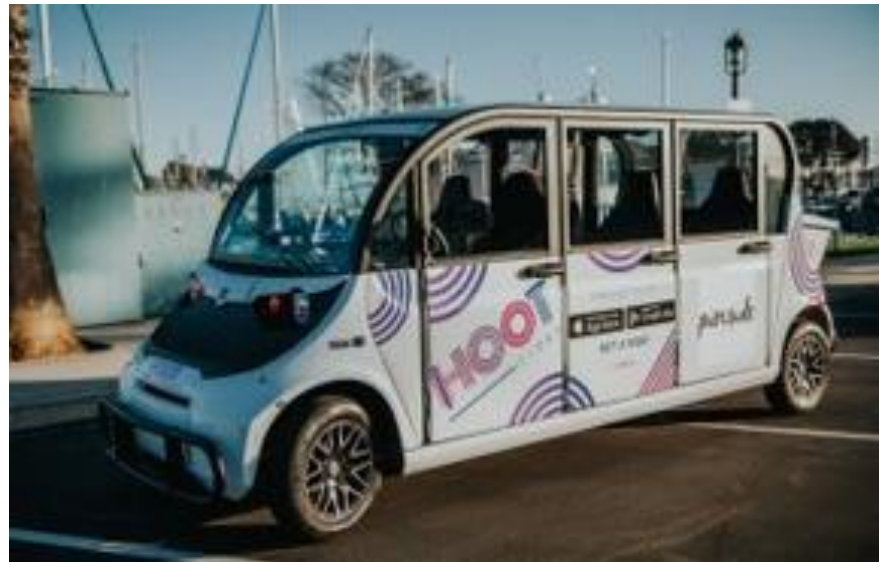
NEV vehicle from HOOT pilot in Oceanside