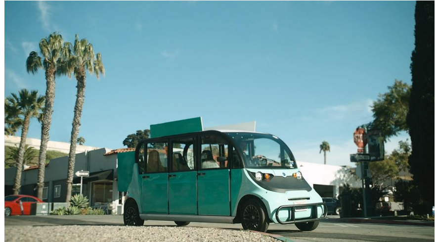
Example of a neighborhood electric vehicle (NEV)