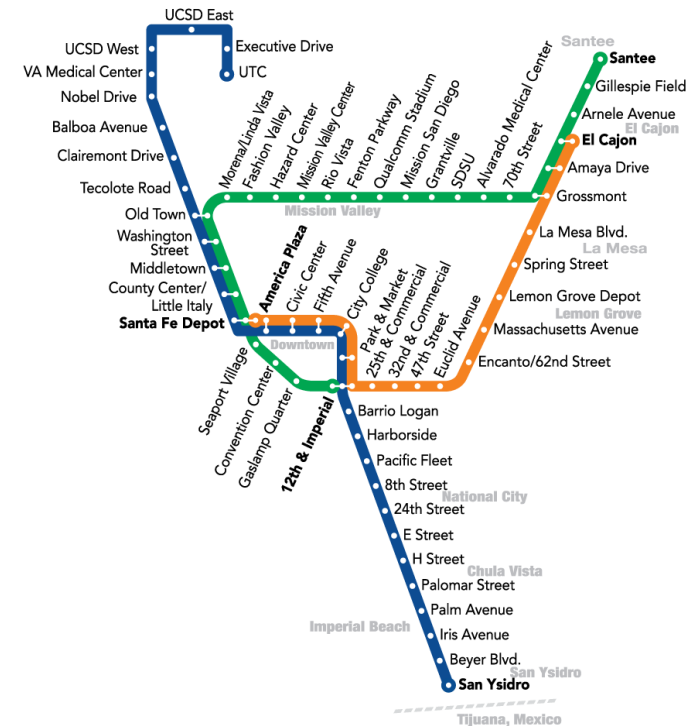
Regional transit connectivity via the "Blue Line" Trolley Extension